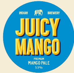
JUICY MANGO HAZY MANGO PALE