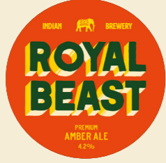
ROYAL BEAST PREMIUM AMBER ALE