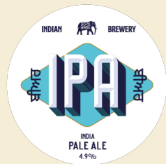
IPA CLASSIC INDIA PALE ALE