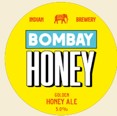
BOMBAY HONEY GOLDEN HONEY BEER