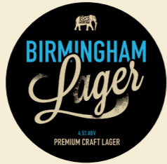
BIRMINGHAM LAGER CRAFT LAGER