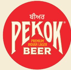
PEKOK LAGER PREMIUM INDIAN LAGER

FROM CRISPY LAGERS TO JUICY PALES, WE HAVE A BEER FOR YOU.