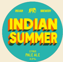
INDIAN SUMMER CITRUS PALE ALE