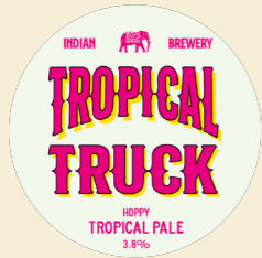
TROPICAL TRUCK HAZY TROPICAL PALE